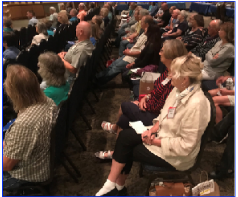
131 Bluebirders joined us in Midlothian

Seeing old friends, making new friends, and networking during breaks is a long standing tradition at the symposium. In addition to great presentations, Chat with the Speakers, Build A Nestbox Workshop, and Lunch With A Speaker were added to the agenda. Of course, as always the FUNdraiser Silent Auction was a big hit.