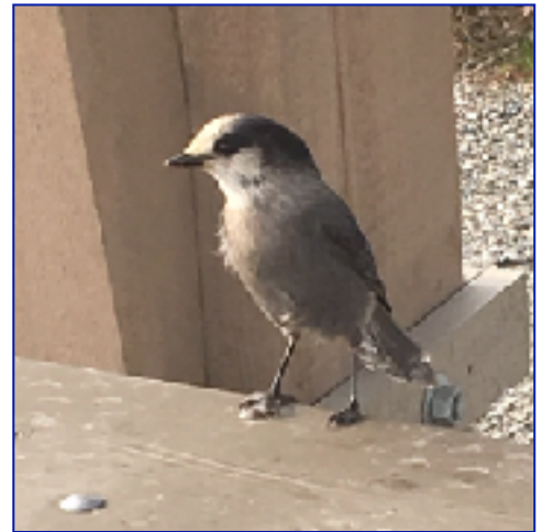
Gray Jay at Denali National Park